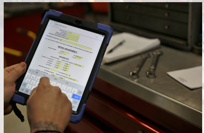
FULL SKF CERTIFIED REPAIR REPORTS