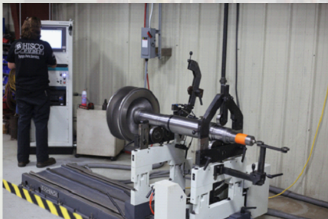
DYNAMIC BALANCING OF IMPELLERS