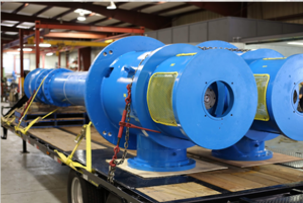
VERTICAL TURBINE PUMPS