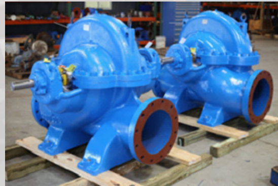
REPAIR AND CERAMIC COATING OF PUMP CASINGS