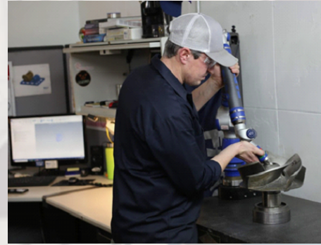
RE-ENGINEERING AND REVERSE ENGINEERING OF COMPONENTS