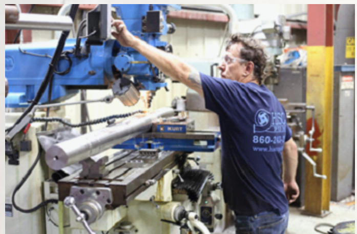
ALL MACHINING COMPLETED IN HOUSE