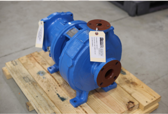
END SUCTION PUMPS