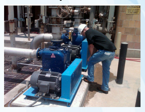
In field solutions for pump issues mechanical or hydraulic